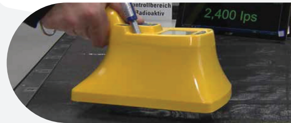
CoMo 170 with BT-module for wireless data transmission