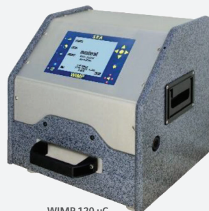
WIMP 120 \mu C