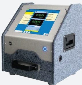
WIMP 120 PC