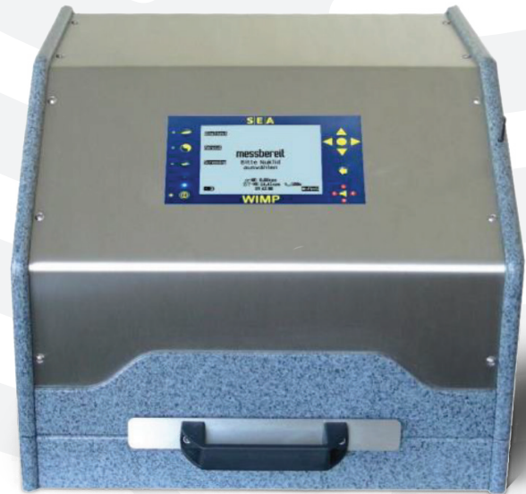
WIMP 220 \mu C