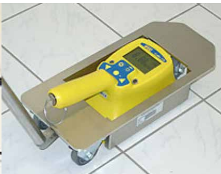
CoMo-170 with floor trolley