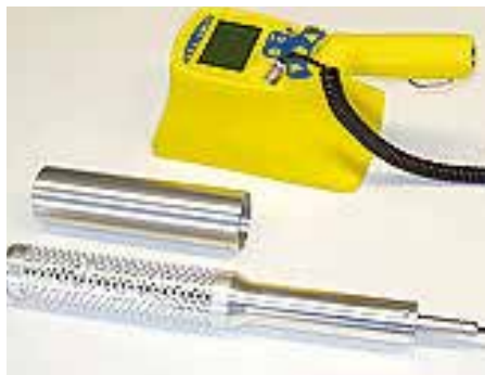
CoMo-170 with PD-43 pipe probe

Our corner detector has no dead zone at the edge. This type of detector has also proved itself for clearance monitoring of corrugated sheets, e.g. of ISO-containers.