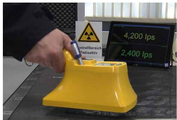
Wireless data value transmission with additional module